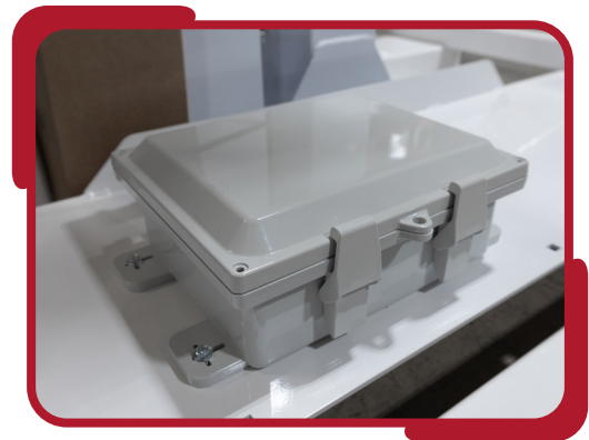
A Stahlin PolySlim low-profile enclosure secured to the base of an OxBlue Periscope. The enclosure prevents unauthorized access to the Periscope's crank tool when it is not in use.