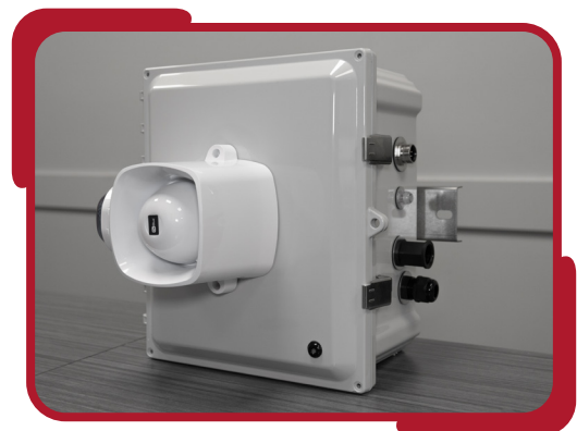
Stahlin PolyStar's polycarbonate construction offers robust protection while maintaining ease of modification, such as adding holes and cutouts.